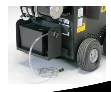
Optional rustfree Float Tank with stainless steel inlet filter. backflow protection and inlet detergent metering valve.