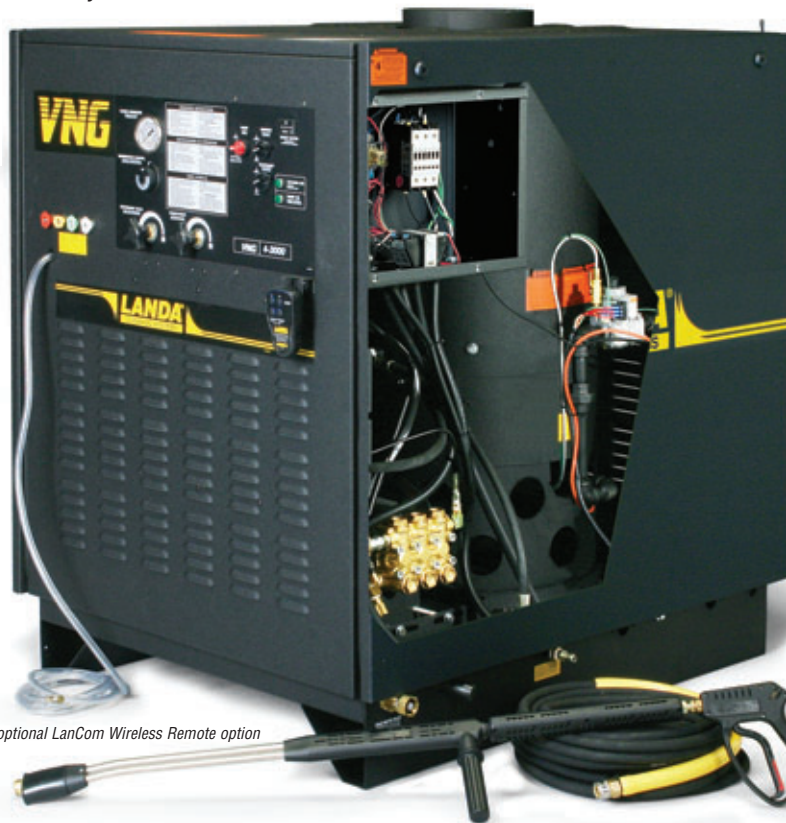
Shown with optional LanCom Wireless Remote option

■ Helpful Tri-Lingual Labels with operating instructions in English, Spanish and French for owner and operator protection.